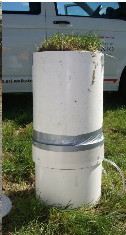
Figure 2. Lysimeter ready for installation, note leachate collection chamber with sampling hose.