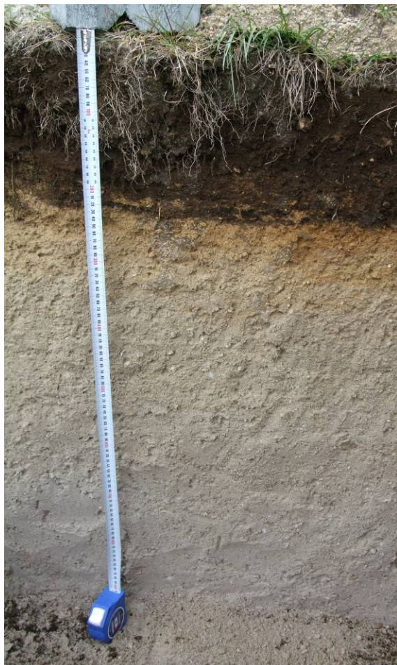
Figure 1. Whenuaroa gravelly sandy loam covering most of the site and used in the lysimeters.

and leachate is collected monthly and volumes recorded. The leachate was analysed for nitrate-N, ammoniacal-N, and TKN by a commercial laboratory, Hill Laboratories. Pasture samples were taken where total N uptake was determined by combustion using the LECO furnace and dry matter was determined by oven drying at 65°C.